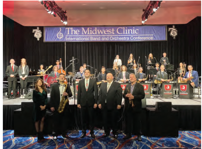
The Jazz Ensemble was the first MHS group to ever perform at the Midwest Clinic in December.

The Honors Wind Ensemble was selected to perform at the 2022 University of Illinois SuperState Concert Band Festival. Selection for participation is competitive and based on blind evaluations of submitted performance recordings. The band performed at the Krannert Center for the Performing Arts in Urbana on May 7.