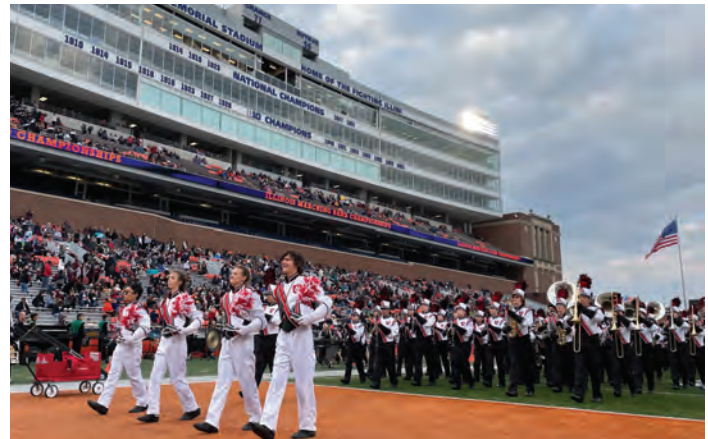
The Marching Mustangs took second place in Class 5A at the University of Illinois Marching Championships in October.