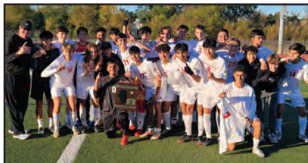
The Boys' Varsity Soccer defeated Lake Zurich and Warren to claim the Regional Championship in October.