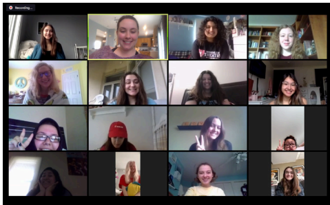
COMPUTER VIEW OF AN E-LEARNING “CLASSROOM”