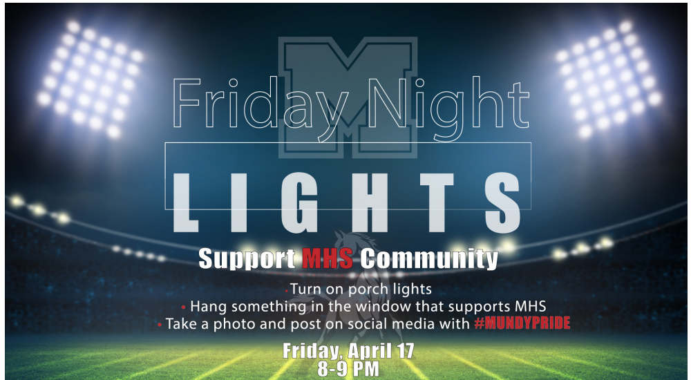
THE MHS COMMUNITY LIT UP THEIR NEIGHBORHOODS IN A SHOW OF SOLIDARITY AND #MUNDY PRIDE ON APRIL 17.

Our community has also shown their #MundyPride with “Friday Night Lights” and hanging posters in their windows.