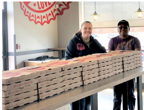
MOD PIZZA OF VERNON HILLS DONATED 40 PIZZAS TO THE MHS FOOD DONATION PROJECT.