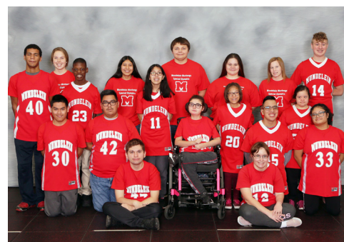
MUNDELEIN HIGH SCHOOL 2020 SPECIAL OLYMPICS TEAM