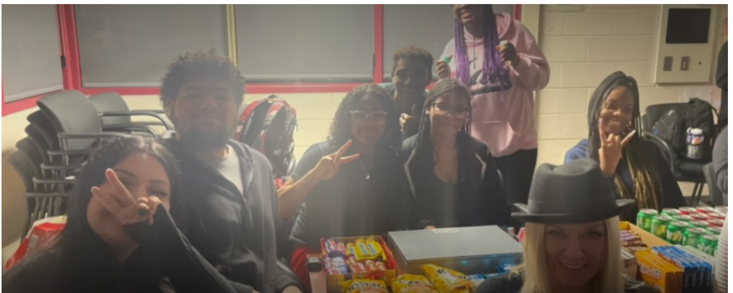
ASPIRE Field Trip