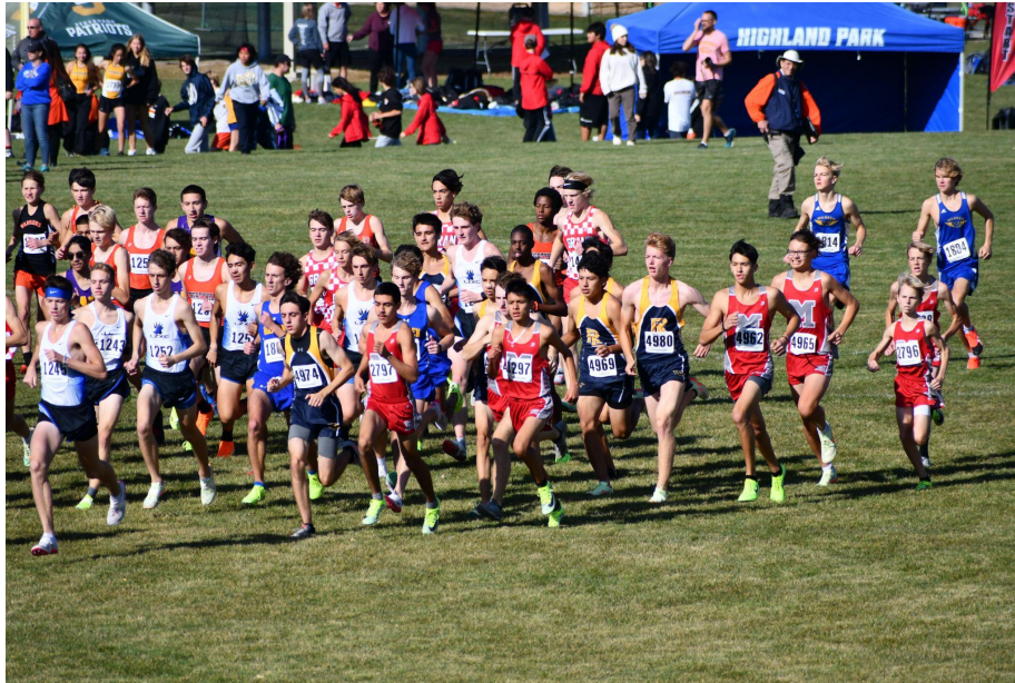
Boys Cross Country at Regionals