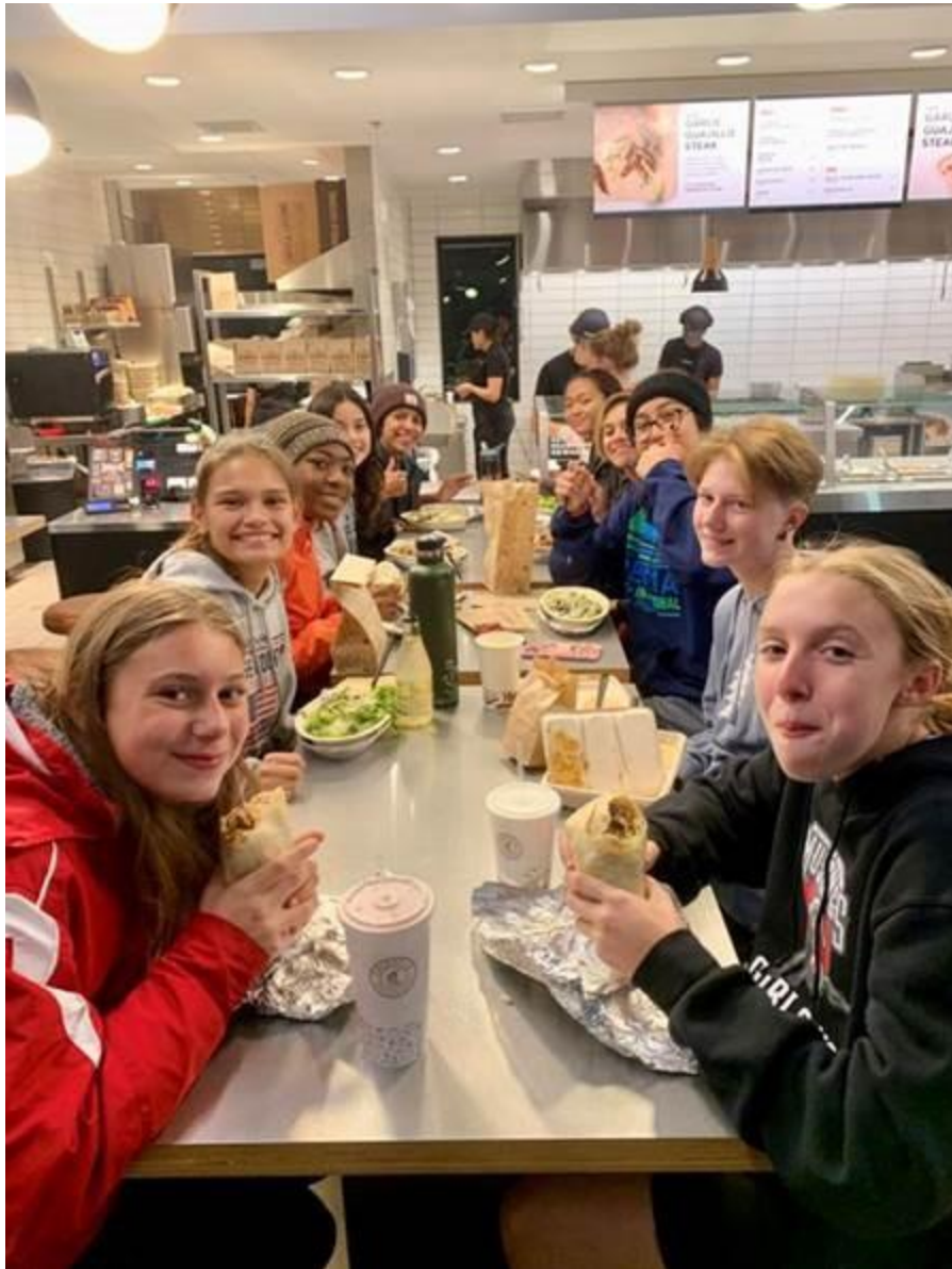
Practice at the Regionals Course with a team dinner afterwards.