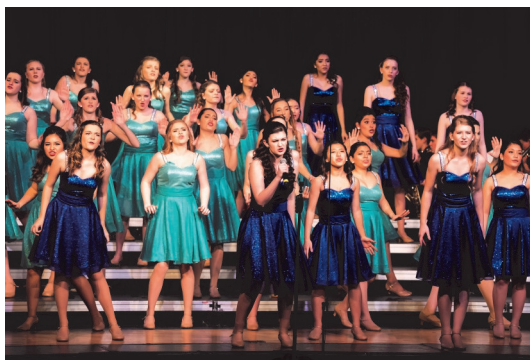
Lights all-female show choir

soloist competition at Arlington Heights, Dominic Cappuccilli was named best male soloist and Sheridan Hurtig was named best female soloist. Cappuccilli was also named Best Male Vocalist in a Show at the Herscher event.