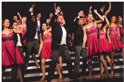
Sound , mixed show choir