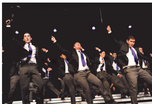
SoundFX , all-male show choir