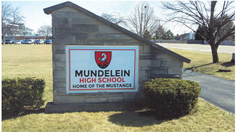
The church sign was recently changed over to reflect that District 120 now owns the property.